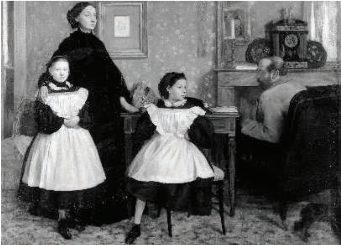
The Bellelli Family by Edgar Degas

This is a painting of two sisters, Giulia and Giovanna, with their mother, Laura, and father, Gennaro. Gennaro (1) is sitting in an armchair by a desk. He (2) ..... towards his family. Laura and Giulia (3) ..... at something behind Gennaro, but Giovanna (4) ..... out of the picture towards the artist. Giulia (5) ..... on a chair with one foot on the floor. Both the girls look rather serious. Perhaps they (6) ..... very still for the artist and they (7) ..... that! The girls and their mother all have black dresses and the girls (8) ..... white aprons, but their mother (9) ..... an apron. In the room we can see a picture which (10) ..... on the wall behind Laura and some papers which (11) ..... on the desk.